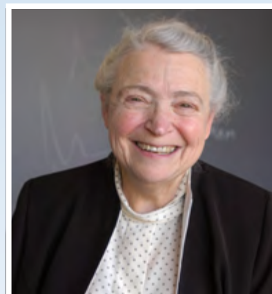
Prof. Mildred Dresselhaus, MIT

Dresselhaus is widely known for her work on graphite, graphite intercalation compounds, fullerenes, carbon nanotubes, and low-dimensional thermoelectrics. ●